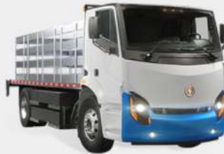
Lion Stake Bed