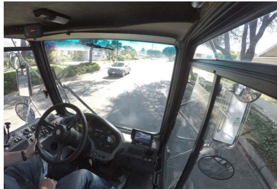
The inherent design of the Global M4 makes it the logical choice among 4-wheel mechanical sweepers. With the center mounted/cab forward layout the operator has unsurpassed visibility of the road surface as well as pedestrians and surrounding traffic. The large hopper capacity equals more lane miles swept between dump cycles and the 18.5-foot turning radius makes the Global M4 highly efficient and comfortable.

LONG LASTING DIRT SHOES Polyurethane Dirt Shoes are designed so that operator has sweep over potholes and rail road tracks and will not damage while sweeping. Long Life of 1000 hours is guaranteed. 47" Gutterbrooms assist in cleaning curbs and heavy Road Millings.