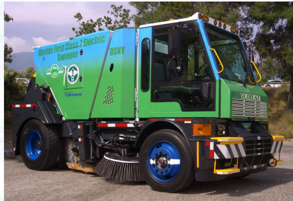
With travel speed of 55-MPH and a battery operational range of up to 11 hours , towns, villages and large cities will be able to clean the streets while protecting our environment and building a cleaner future with ZERO EMISSIONS . At the end of the shift just plug in the sweeper, charge the batteries and repeat and sweep again.

Global M4 includes a 5.6 cu/yd hopper capacity compared to 4.5 cu/yd for competitive machines resulting in more curb miles swept between dump cycles. With near Full Useable Capacity, 12,000 Lift Capacity, and the Optional Elevator and Hopper Wash Out System, Global M4 is Affordable, Reliable and innovative.